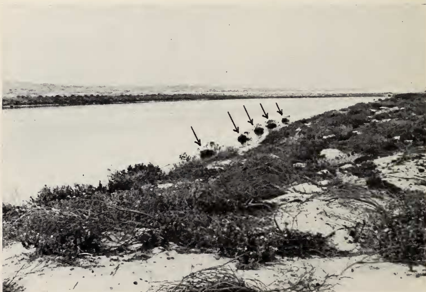
Fig. 2. Position of some of the nests, indicated by arrows, along the shore of the middle pan. Note the rooted bushes to which the nests are anchored. The dots on the water are Black-necked Grebes.

The habitat around the breeding colony consisted of typical „strandveld" i. e. sand dunes covered with shrub and low sclerophytic vegetation. Practically all nests were built along the shore line of three fairly narrow rectangular artificial pans with a distinct preference for the middle one of the three. In figure 1 the position of the nests has been roughly indicated. The breeding activity was spread over the months September and October. The nests varied from flimsy half submerged accumulations of water plants and sometimes shore plants (fig. 3) to rather substantial and built up platforms. Although on the surface of the water, most of the nests were not floating freely as they were anchored to rooted bushes growing out of the water (fig. 2). This prevented the nests of following fairly extreme and rapid fluctuations of the water-level. Fluctuations of the water-level occurred daily due to intake and discharge of water in the pans. These fluctuations became extreme during strong wind conditions or when heavy rain fell. This happened at several occasions during the breeding period and resulted in heavy casualties of eggs. The flimsiness of many of the nests caused them to break up when the water became rather choppy especially when there was a strong on-shore wind and this also resulted in the loss of many eggs. It was interesting to observe how both birds of a pair would immediately start nest-building activi-